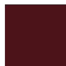
Burgundy RAL 3005