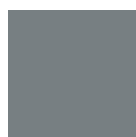
LW04 Grey RAL 7037