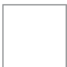
White RAL 9016