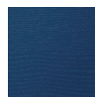
CNA06 Navy Blue