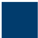
LW06 Navy Blue RAL 5003