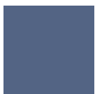
Blue RAL 5014