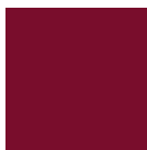
LW07 Light Burgundy RAL 3004