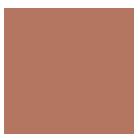
Terracotta RAL 3012