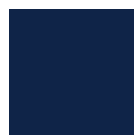
Navy Blue RAL 5003