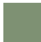
Salvia/Green RAL 6021