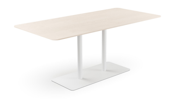
Revo Table T180 RAL 9016 NA