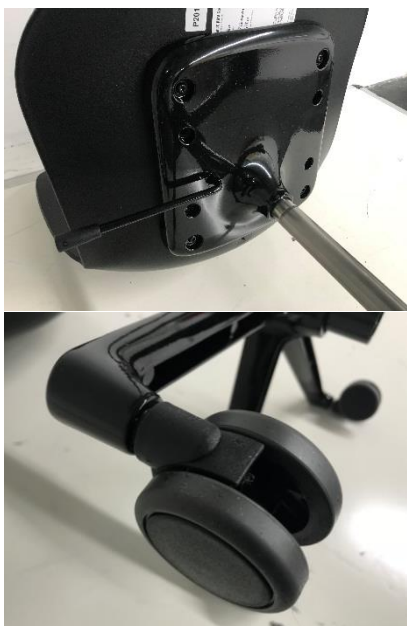
Pic.5: Base mechanism and castor