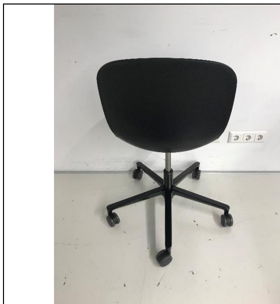
Pic.3: Back view