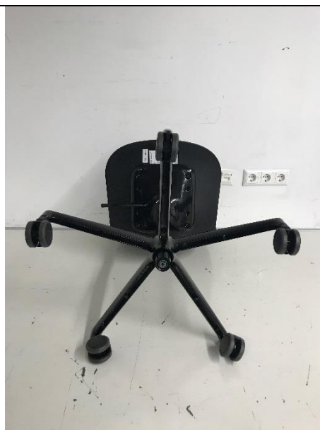
Pic.4: Bottom view