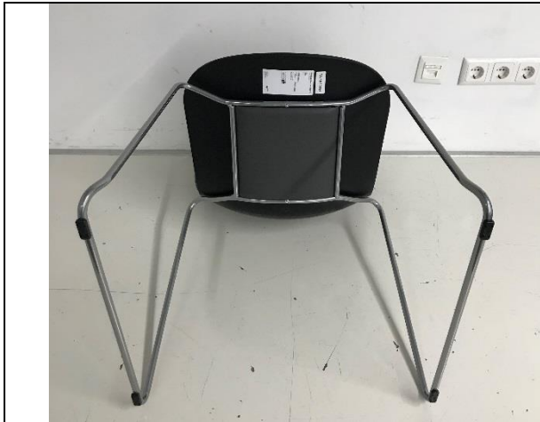
Pic.3: Bottom view