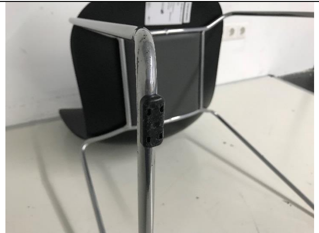
Pic.4: Foot glider