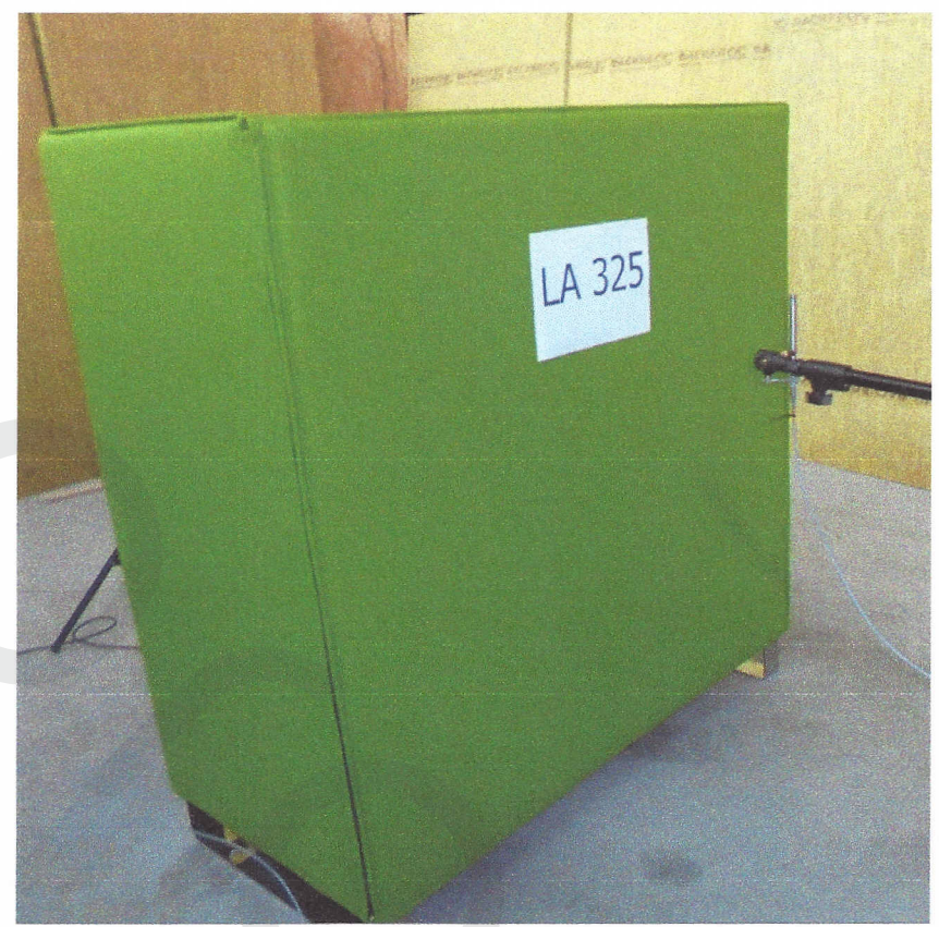
Fig. 2. Placing the microphone at a distance of 35 cm from a screen