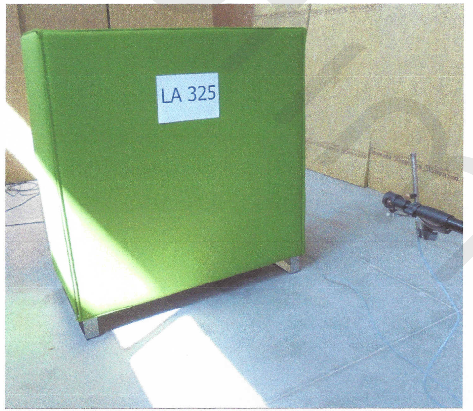
Fig. 3. Placing the microphone at a distance of 140 cm from a screen