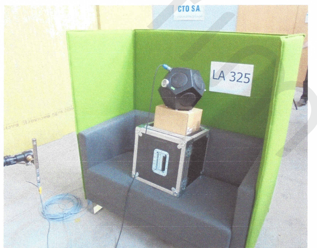
Fig. 5. Placing the sound source on the sofa at a height of 110 cm