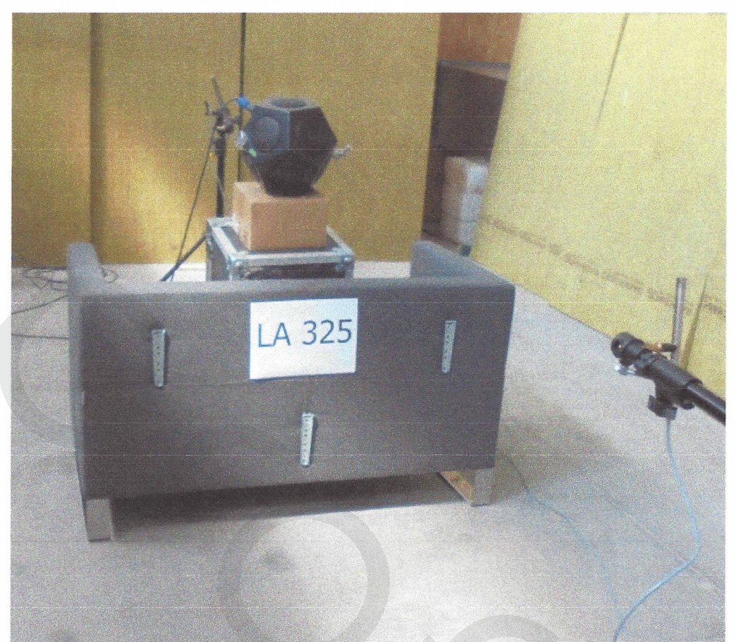
Fig. 4. Placing the microphone at a distance of 140 cm from the sofa without a screen